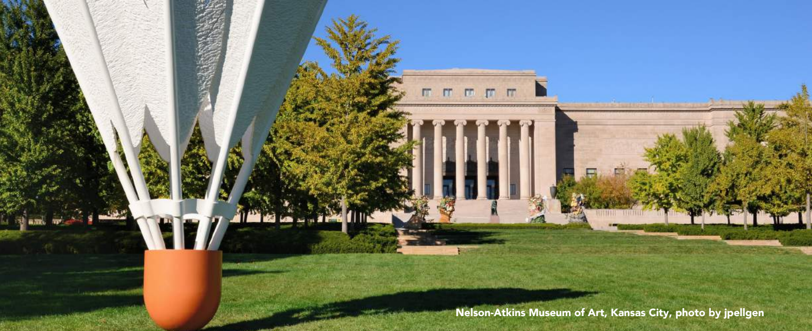
Nelson-Atkins Museum of Art, Kansas City