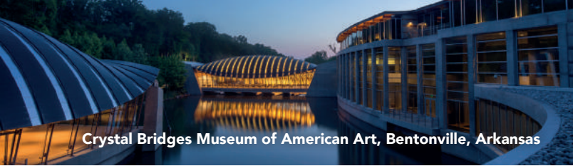
Crystal Bridges Museum of American Art, Bentonville, Arkansas

The group will have lunch in Independence before transferring by motor coach to Bentonville, Arkansas, where you'll enjoy a two-night stay. You may opt to visit the sprawling Crystal Bridges Museum of American Art early at your own pace, taking advantage of the museum's late hours on Friday and exploring the pavillions at dusk. You may also enjoy the evening at leisure to admire the charming, rapidly growing Ozark town of Bentonville. B,L