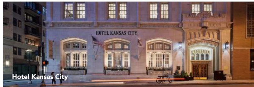
Hotel Kansas City

At this unique hotel, contemporary art meets elegant hospitality, sweeping you away to an avant-garde world of boundary-pushing exhibitions and installations. Upstairs, chic rooms outfitted with luxe beds and amenities provide a modern oasis. Downstairs, 12,000 square feet of galleries offer an evolving showcase of today's most cutting-edge creations. Have breakfast next to a buzzing neon sculpture, then stroll through surreal landscapes and multimedia wonders.