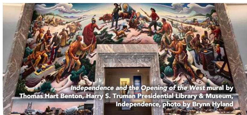
Independence and the Opening of the West mural by Thomas Hart Benton, Harry S. Truman Presidential Library & Museum, Independence

After checking out of the hotel in Kansas City, embark on a short excursion to Independence, Missouri, the hometown of President Harry S. Truman. Delight in a special inside look at the impressive, technologically advanced Harry S. Truman Presidential Library & Museum, established in 1957 and reopened in 2021 after a $29 million renovation, the largest in its history. Discover its complete reimagination of Truman's vast legacy, featuring interactive exhibits like Loyalty Oath , which puts you in the place of the 33rd President during some of his most consequential decisions. Stop to see a colorful mural from Thomas Hart Benton, 1961's Independence and the Opening of the West , specially commissioned for the library.