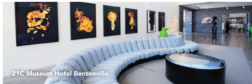
21C Museum Hotel Bentonville