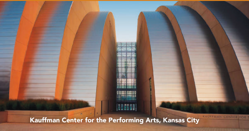
Kauffman Center for the Performing Arts, Kansas City