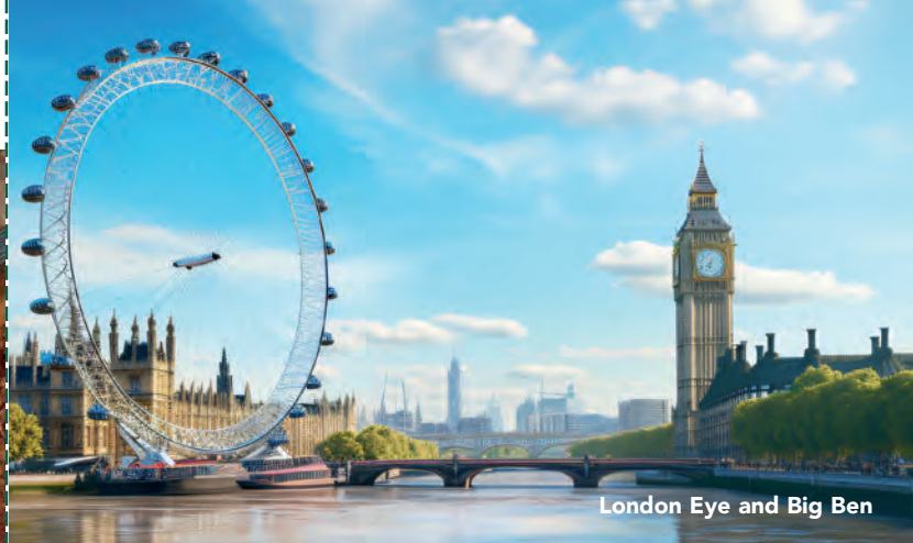
London Eye and Big Ben