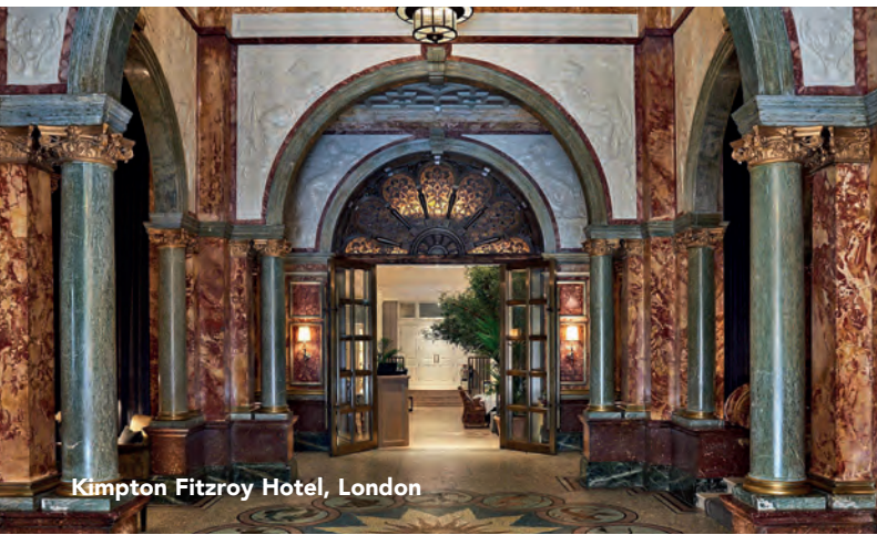
Kimpton Fitzroy Hotel, London