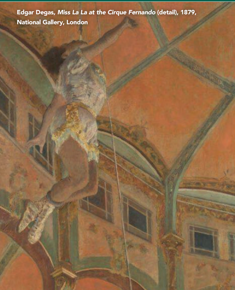
Edgar Degas, Miss La La at the Cirque Fernando (detail), 1879, National Gallery, London