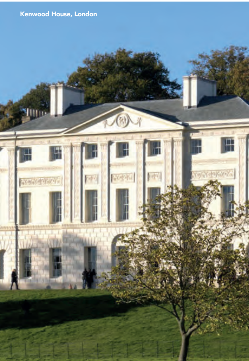
Kenwood House, London

After the tour, enjoy lunch and the afternoon at your leisure. In the evening, experience a culinary tribute to Africa's global culinary influence at Stork, whose name was inspired by the extensive migration journey of the famed long-legged bird. The restaurant celebrates Africa's gastronomical richness and creativity through vibrant food and art, highlighting authentic flavors, textures, and artistic presentations. Indulge in a seasonal Pan-African menu for a dining experience that celebrates the depth and diversity of African flavors. B,D