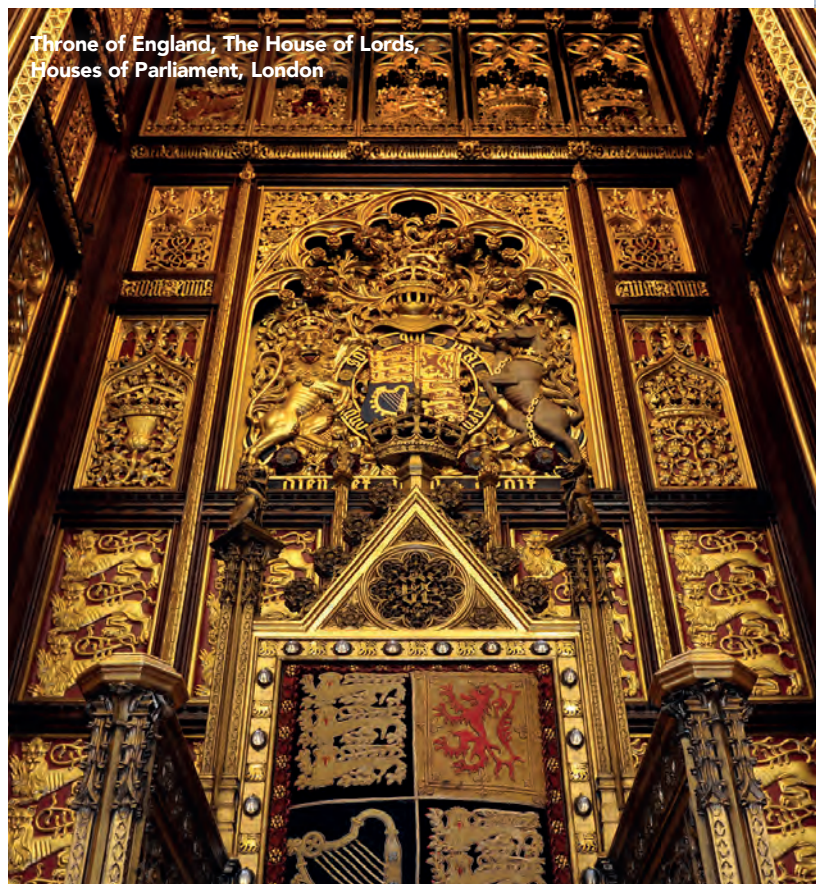
Throne of England, The House of Lords, Houses of Parliament, London