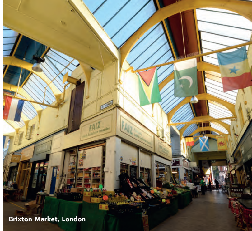
Brixton Market, London

Conclude with a Champagne reception and a private ride in a London Eye pod offering breathtaking panoramic views of the city, followed by a memorable dinner. B,L,R,D