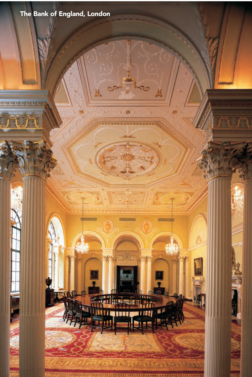
The Bank of England, London

This evening, indulge in a five-course meal with drink pairings at James Cochran's iconic establishment, 12:51 By Chef James Cochran, named after a song by the American rock band The Strokes. Driven by Caribbean and Scottish influences, Chef Cochran has curated a menu full of personality and joy, winning him the prestigious "Eater London Chef of the Year" Award. B,D